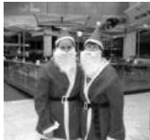
Santa Walk 2011 - reader photos