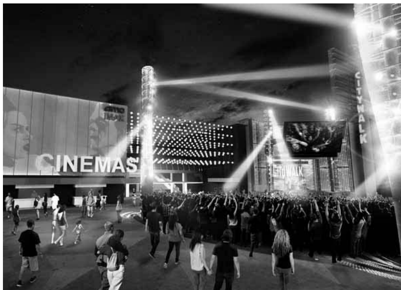
CityWalk's new "5 Towers" concert venue

By Bob Strauss, Staff Writer Posted: 06/30/2011 05:07:32 PM PDT Updated: 06/30/2011 10:06:26 PM PDT